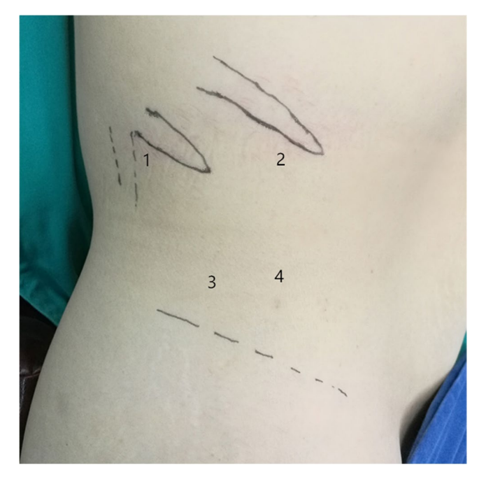
Figure 1. Port sites for single-plane retroperitoneal adrenalectomy. 1, 12-mm port below the 12th rib in the posterior axillary line. 2, 12-mm port (right side) or 5-mm port (left side) under the subcostal margin in the anterior axillary line. 3, 10-mm port above the iliac crest in the midaxillary line for the laparoscope. 4, 5-mm port placed ventral to and along a transverse line with the trocar above the iliac crest.

with a BMI of \geq 30 kg/m<sup>2</sup>. The results showed that for obese patients, single-plane adrenalectomy also had a significantly shorter operation time and did not increase perioperative complications compared with anatomical three-plane adrenalectomy. Moreover, the operation time of single-plane adrenalectomy was comparable between obese patients and the total patient population. This result was mostly due to the main advantage of single-plane adrenalectomy; namely, that it does not require isolation of the lateral side of the kidney and removal of excessive perirenal fat, which is time-consuming, especially in obese patients. Difficulties caused by obesity during single-plane adrenalectomy, such as a limited operative space or difficulty in adrenal identification, did not bring more technical challenges to surgeons. Additionally, adhesion within the operation field increases complications and the operative time<sup>16</sup>. For patients with perinephric adhesion due to diabetes or a surgical history, anatomical three-plane adrenalectomy may be more difficult and time-consuming because of excessive isolation of the lateral side and upper pole of the kidney. The superiority of single-plane adrenalectomy may be more obvious in these patients. We are doing to verify that in following study.